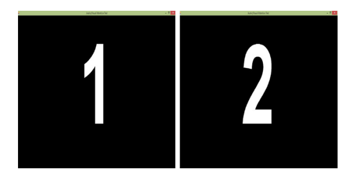
Fig. 1 The visual cues used during the experiment

This study is structured to understand mental load of air traffic controllers during a visual and auditory reaction test. Both narrow- and wide-band QEEG analyses are used to avoid a possible misinterpretation from using a wide-band analysis alone. A narrow-band analysis relies on a 1 Hz resolution or less. For example, if alpha is 8–12 Hz, a narrow-band analysis would create the following four levels of alpha bands: alpha-very-low (8 to <9 Hz), alpha-low (9 to <10 Hz), alpha-high (10 to <11 Hz), and alpha-very-high (11 to <12 Hz).